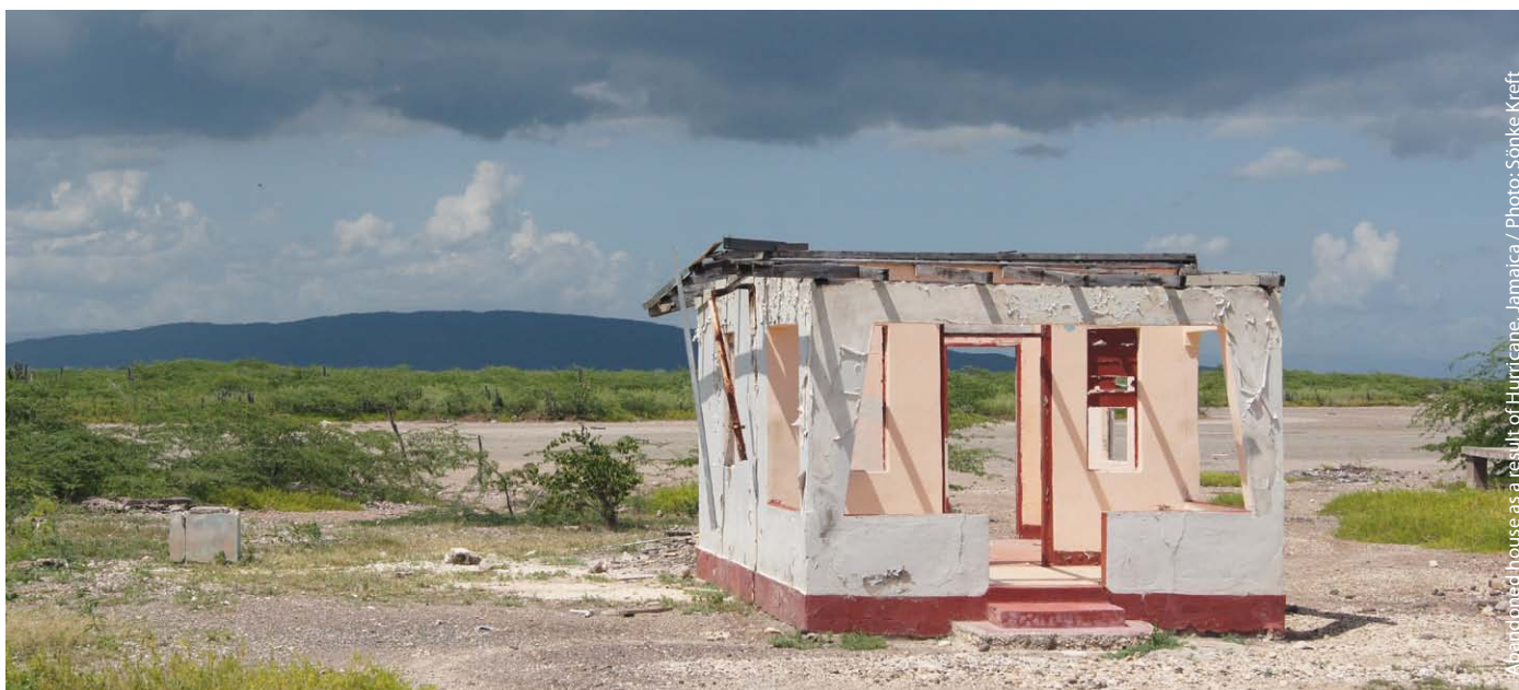
Abandoned house as a result of Hurricane, Jamaica

Climate impacts take increasingly toll among vulnerable people.