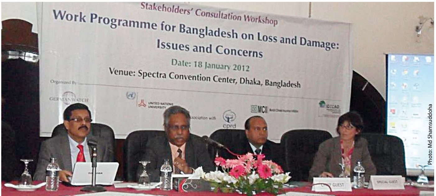
Proactively preparing for the worst: The project explores implication of loss and damage on national decision making in Bangladesh.