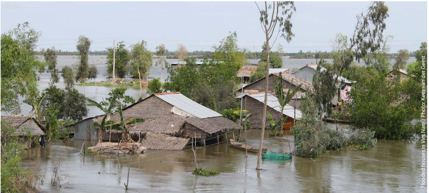
Flooded houses in Viet Nam

Loss and Damage: Adaptation to climate change brought to the extremes?