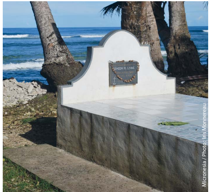
Example of non-economic losses: Sacrificing culture and heritage to the rising seas.

The Loss and Damage in Vulnerable Countries Initiative has four main activity areas designed to both interact with and complement each other. The activities will support LDCs and other vulnerable countries articulate their needs vis-à-vis loss and damage and help create momentum in the loss and damage debate. These activity areas include: