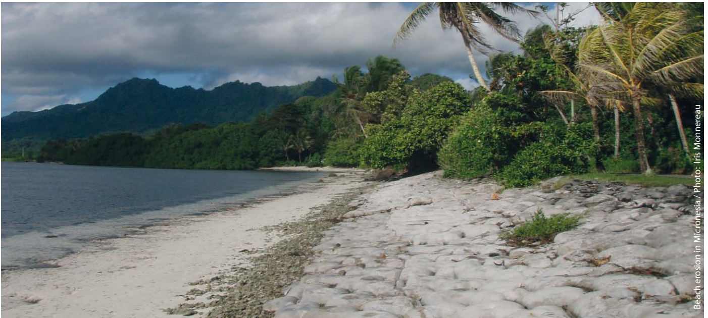
Beach erosion in Micronesia