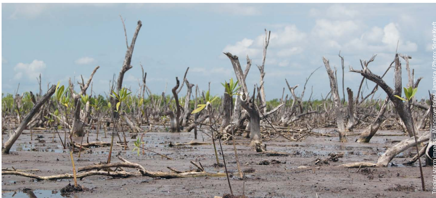
Tropical storm impacts – Mangrove forest, Jamaica

Sea level rise and weather extremes have disastrous consequences for nature and people: SIDS and LDC call for a response of the international community.