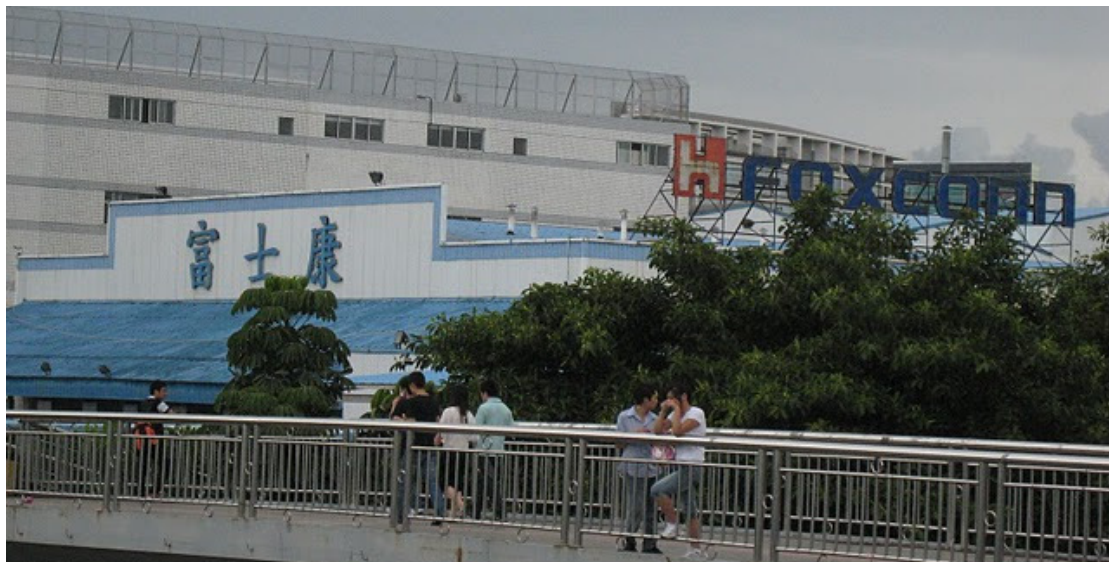
Footbridge outside southern gate of Longhua campus, Foxconn. One of the interview sites of SACOM investigations.

This report aims to reveal the actual working and living conditions of workers at Foxconn to mobilise public support for their struggle against their plight. Instead of ineffectively pleading corporations to restrain themselves against labour rights violations, SACOM urges concerned organizations, consumers, investors, and the government to join the workers to pressure electronic factories to deliver decent working conditions in the electronic industry.