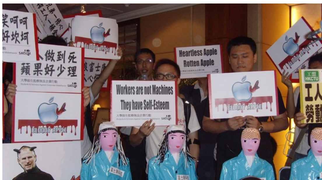
SACOM and other labour organizations in Hong Kong staged a protest outside the shareholder meeting of Foxconn on 8 June 2010.

In the Apple Supplier Code of Conduct, it states that workers will not be harassed, that working hours will be in compliance with local law, and that overtime work should be on voluntary basis. Disappointingly, these are merely promises on paper.