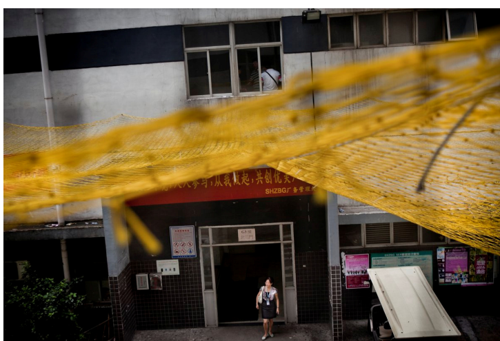
Upper: entrance of Foxconn campus Lower: safety net inside Foxconn campus