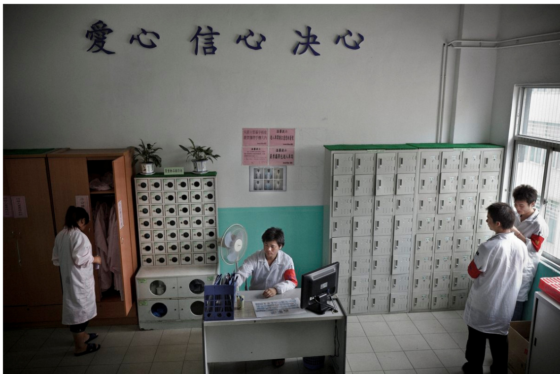
Area outside the shop floor where workers change their uniform. “Love, Confidence, Determination” is printed on the wall.

When asking workers what needs to be improved at Foxconn, most responded that frontline management should be more civil. Many interviewees reported that production line leaders did not have any skill in management, and that they would only yell at workers if there was