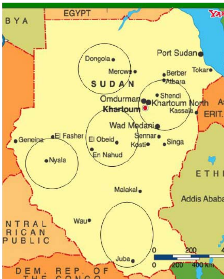
Figure 1: Particularly vulnerable rural areas in the Sudan

such an identification). Around another 10% are vague regarding this issue. Phrases such as “coastal zone” or “areas with great environmental pressure” fit into this category. The following formulation is one of the very rare, relatively concrete ones: “Settlements on the south-western coast were found to be most vulnerable, and much of Barbuda is likely to be inundated under a one metre sea level rise scenario”. 24 The Philippines’ National Communication from 2000 also provides a more concrete example: “Densely populated areas along the coast, especially the squatter areas of Navotas and Malabon, may survive ASLR [Accelerated Sea Level Rise] but will be very vulnerable to severe storm surge(s)”. 25 Vulnerability mappings are almost non-existent in the documents screened. Sudan’s NAPA is one of the few exceptions (see figure 2).