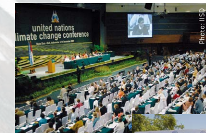
The UN climate summit in Bali, 2007. Germanwatch is active in Germany, in the EU and worldwide in different political negotiation processes.

We advocate for a political, economic and social framework which can ensure a future for the people of the South, who are being pushed to the margins of society through unbridled globalisation and whose very existence is threatened by the loss of their ecological and economic foundations of their livelihoods.