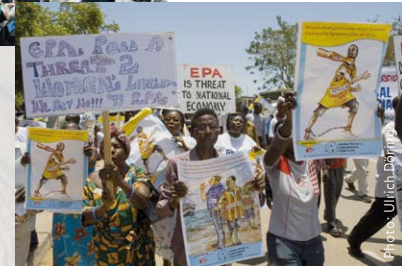
Germanwatch gives a voice to those whose concerns are heard too little: the people in the countries of the south affected by our lifestyles and our politics. Here: protests by farmers in Ghana against the EU trade policy.