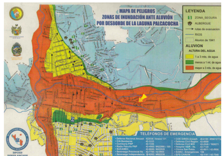
Highlighted in orange, the hazard map shows those city areas of Huaraz which are particularly threatened by high waters and a flood from the glacial lake Palcacocha (the arrow in the town center marks the location of the home of the Luciano Lliuya family).