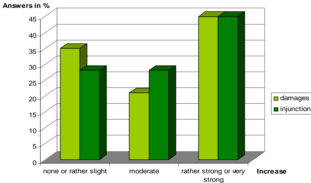
Figure 1: Development of claims directly related to climate change

These results clearly suggest that the possibility of an increase in legal actions as a result of direct climate damage is real. Private law, particularly tort, cases would be the obvious legal track for such claims (although human rights actions might also play a part). Public nuisance, negligence and private nuisance are considered the most promising tracks for damages cases by survey participants.